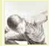
Alumni Art, 10