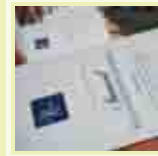
JCC Board Chairs Honored, 8