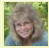
Faculty Profile, 5