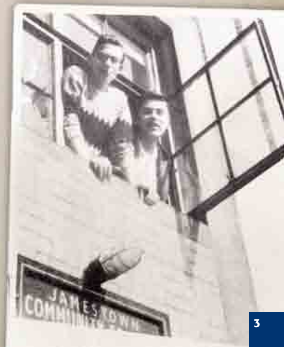
[Class of 1952 Jamestown Community College students]

Although most of transferred to other colleges, most of us look back on those days at JCC as special ones. I wouldn't trade those days for anything!