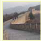
Experience of a Lifetime in China, 3