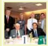
JCC Foundation Annual Report, 9