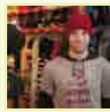
Alumni Profile, 5