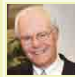
JCC Foundation Awards, 6